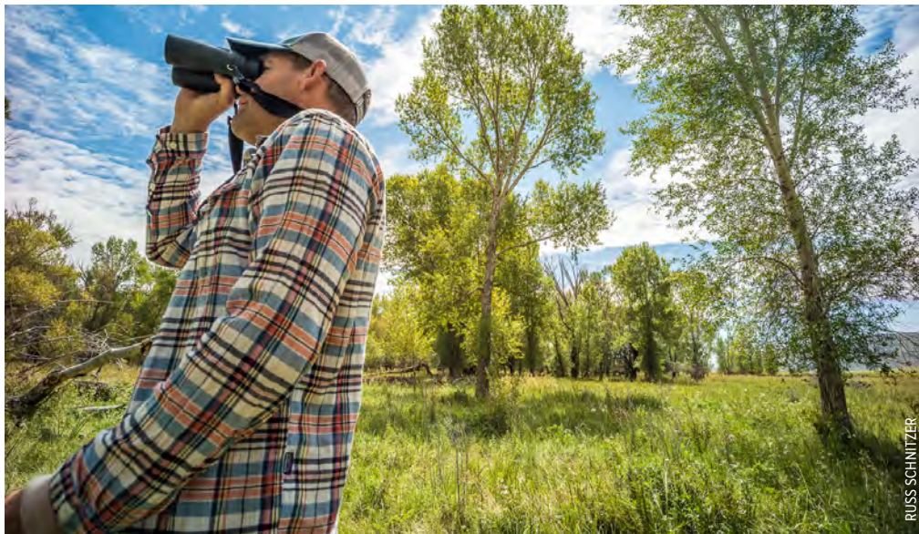
The Olguin Ranch lies at the confluence of the Conejos River and the Rio Grande and is home to diverse bird life, including endangered southwestern willow flycatcher and threatened western yellow-billed cuckoo.

Now that we own the ranch, we hope to work with the Idaho Department of Fish and Game to place a conservation easement on the property, preventing a large subdivision on the river's edge and ensuring this stretch of the Snake River stays healthy for the river's fish and wildlife.