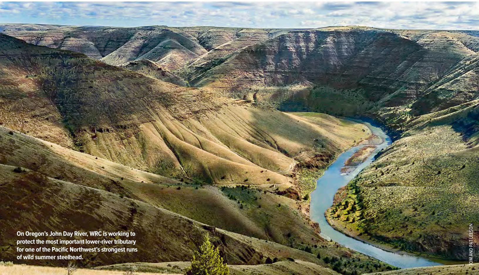
On Oregon's John Day River, WRC is working to protect the most important lower-river tributary for one of the Pacific Northwest's strongest runs of wild summer steelhead.

Restoration efforts have already begun on Thirtymile Creek and will continue as WRC transfers the ranch lands to the BLM. While we are proud to deliver public access to this great Oregon river and the lands along it, what matters most is the biological integrity of Thirtymile Creek. Protecting and restoring this crucial stream is key to the long-term vitality of one of the Pacific Northwest's healthiest runs of wild summer steelhead, as well as the salmon, bighorn sheep and other wildlife that define this dramatic slice of the Columbia Plateau. ■