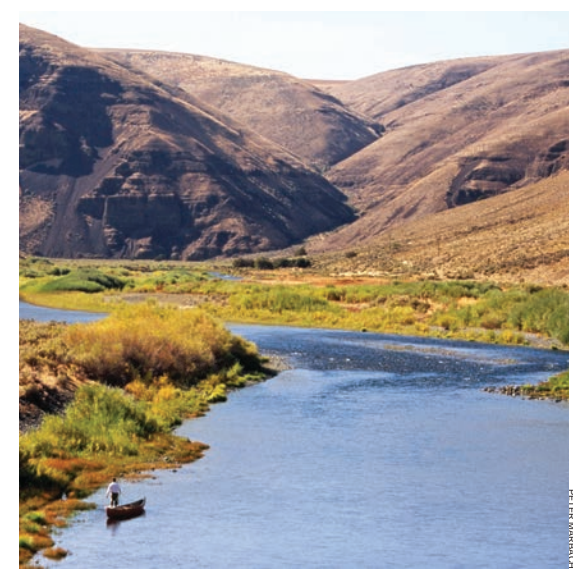
The John Day River boasts healthy runs of wild summer steelhead, fall and spring Chinook and bull trout.

Today, the Big Chico Creek Ecological Reserve is managed primarily for education and research. The Reserve provides opportunities for hands-on learning by students from CSU and local schools. Visitors are welcome to hike, view wildlife, fish and hunt.