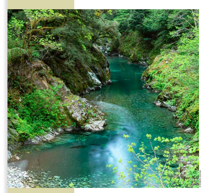
Elk River provides critical salmon and steelhead habitat.