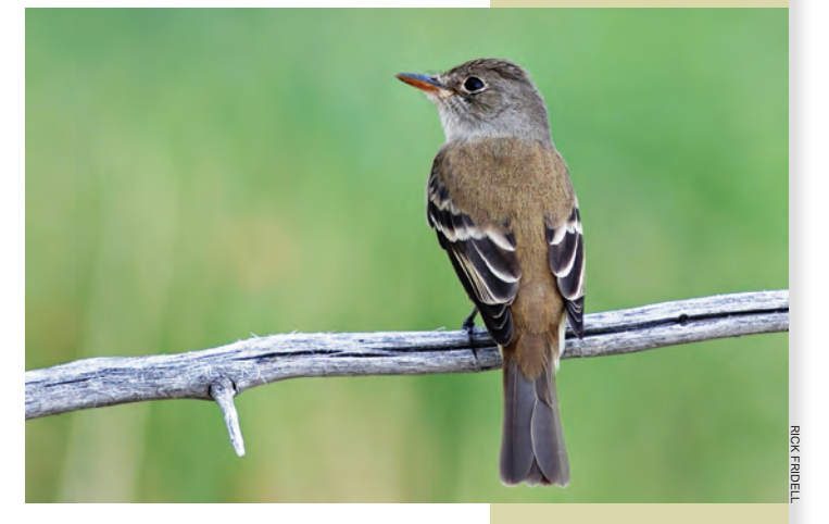
WRC's efforts on the Río Grande will conserve habitat for endangered southwestern willow flycatcher.

It is rare for a San Luis Valley property of this size to come up for sale along the Rio Grande. Given the opportunity, we are moving quickly to acquire these lands. Once the project is complete, an extensive and important reach of this great river will be conserved and open to the public forever.