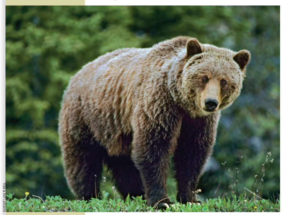
The grizzly bears documented near Big Sheep Creek are believed to make up 50 to 75 percent of Washington's recovering grizzly population.