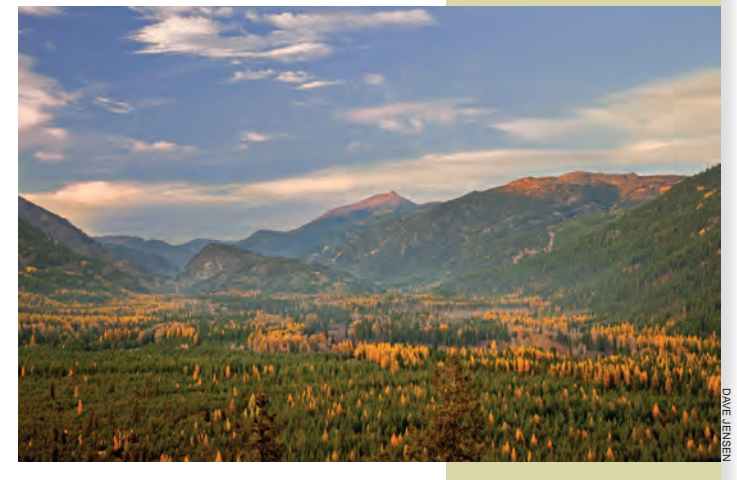
WRC is working to purchase 2,400 acres along Big Sheep Creek to protect priority habitat for redband trout and rare carnivores.

essential to these animals and their movement throughout the region. In addition to its importance for fish and wildlife, the land also includes a stretch of the Pacific Northwest National Scenic Trail, which runs through the southern area of the property. Acquiring the remaining 1,400 acres will place a unique section of this scenic trail into public hands. It will improve wildlife viewing opportunities and help ensure this recreational treasure remains intact and open to the public forever.