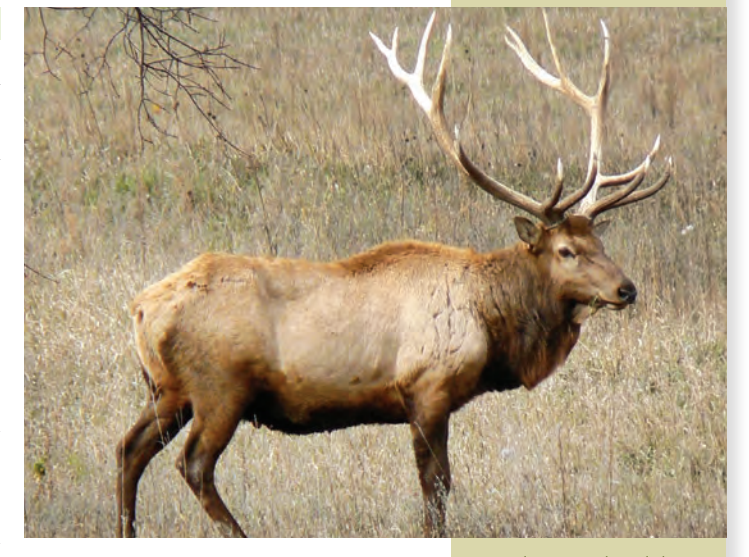
Gumdrop Ranch and the surrounding public lands provide key habitat for one of the largest elk herds in the continental United States.

WRC's purchase also creates a 2.5-mile river sanctuary for four endangered desert fish: Colorado pikeminnow (which can reach six feet long), humpback chub, bonytail chub and razorback sucker. Even in its driest years, the Yampa provides one-third of the habitat left on earth for these ancient fish.