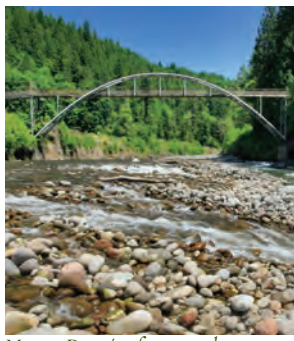
Marmot Dam site after removal.

for fish and a vast, densely forested riverland playground for the public – all within 25 miles of the Pacific Northwest's third largest city.