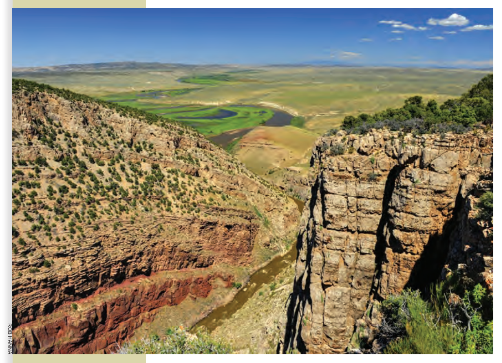
WRC's purchase of Gumdrop Ranch conserves 2.5 miles of the Yampa River at the entrance to Cross Mountain Canyon and opens access to 88,000 acres of public land.