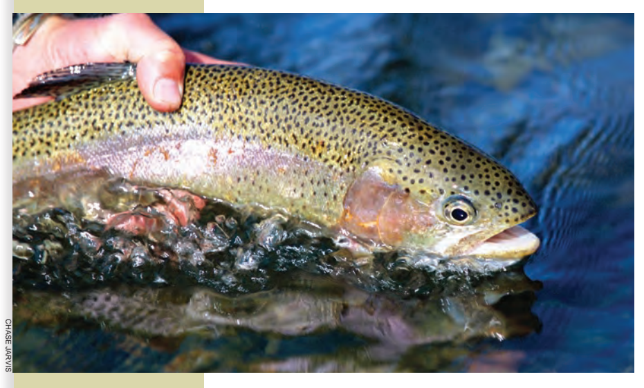
Restoring year-round flows to Colorado's Little Cimarron River will improve habitat for rainbow trout and other native fish.

Launching a groundbreaking project that may serve as a model for future river conservation in Colorado, Western Rivers Conservancy (WRC) recently purchased a key property above the Centennial State's Little Cimarron River. A jewel of a stream, the Little Cimarron's upper 13 miles