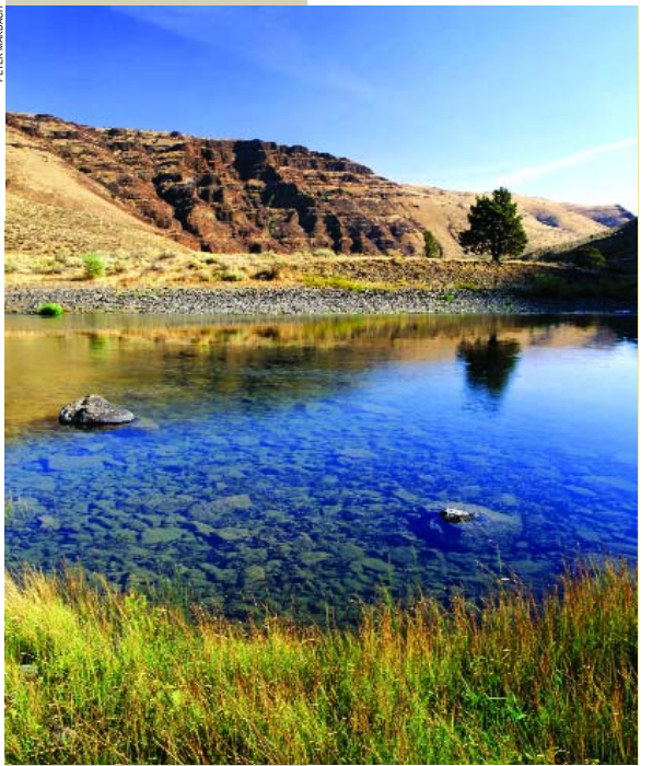
The lower John Day River, Oregon.