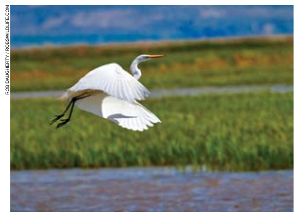
A great egret takes off from the project area.

WRC is purchasing both tracts from Davidson Industries of Mapleton, Oregon, and is working to secure funding to convey them to the Siuslaw National Forest to be managed for fish and wildlife habitat while providing public access.