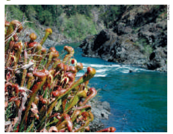
The Illinois River Valley is home to fascinating geology, rare plants and very healthy salmon streams.

In December 2008, Western Rivers Conservancy conveyed the property to the Institute. A former ranch house is now the Deer Creek Center, with course offerings in partnership with Southern Oregon University.