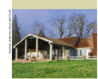
A former ranch house is now the Deer Creek Center.