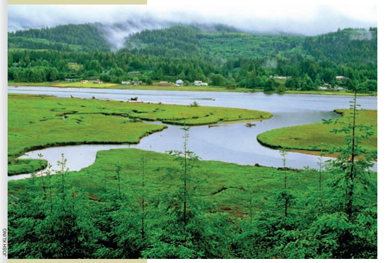
The north channel of the Alsea River flows into Alsea Bay. The estuary provides essential habitat where young salmon forage and take shelter.