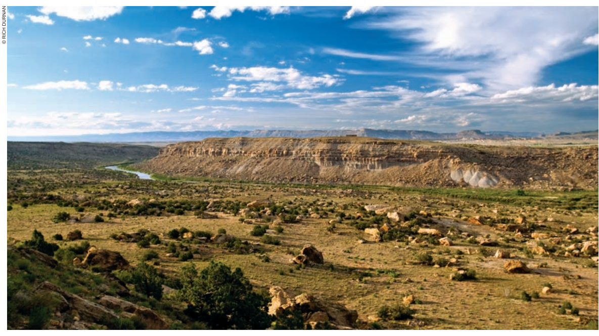
Our next purchase traces several miles of the Gunnison, surrounded by the Dominguez-Escalante National Conservation Area.

The lower Gunnison is one of few places where four species of Colorado Basin warm-water fish still survive, including the razorback sucker.