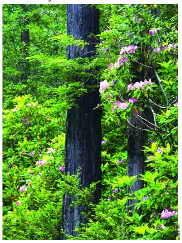
In late October 2006, WRC purchased 43 acres in the Winchuck River basin, home to many of Oregon's last redwood groves. The Winchuck is an important coastal fishery just north of the Oregon-California border.