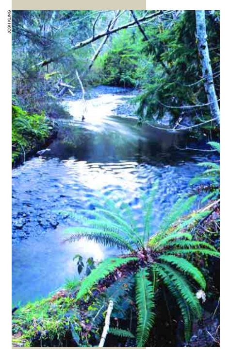
Cold Creek (above) flows into Beaver Lake, supporting a wealth of wildlife together with the surrounding marsh.

Right: marbled murrelet and northern river otter.