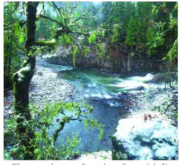
The conserved property lies at the confluence of the East and West Forks of the Hood River, a scenic access point with a healthy riparian forest and basalt cliffs.

This is Western Rivers Conservancy's first land Please see Hood River, page 2